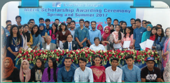
Award Recipients Of Summer Semester