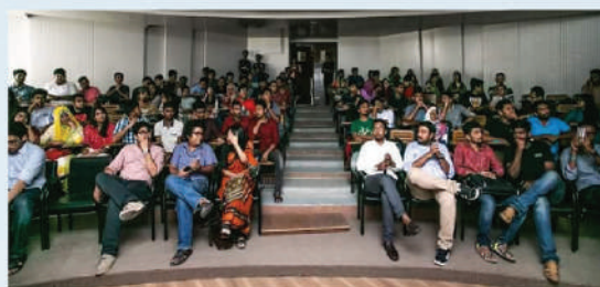
Short film exhibition by Projonmo Talkies

The club has recently launched its own website which is a direct medium of communication for club members.