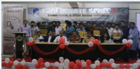
Winners and runners-up of the competition