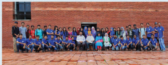
Club members with the faculty members at the Summer Celebration

An event— Summer Celebration took place on 6 August 2017. T-shirts with the club logo were printed, a cultural event and lots of other activities were also arranged.