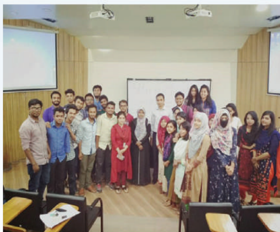
Workshop on Longitudinal Data Analysis