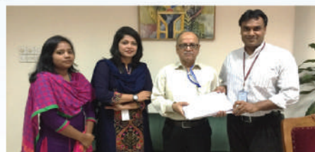
EWUCRT personnel with the Chairman of UGC