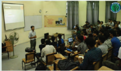
The workshop on the run

The recent program that was organized by EWUTC was Intra University Telco Warfare 2017. The event was held for the 6th time on 23 July 2017. The program covered five different competitions. These were Tele war basic, Tele war advanced, Knowledge war, Idea war and lastly G war. 270 students from different departments participated in the event.