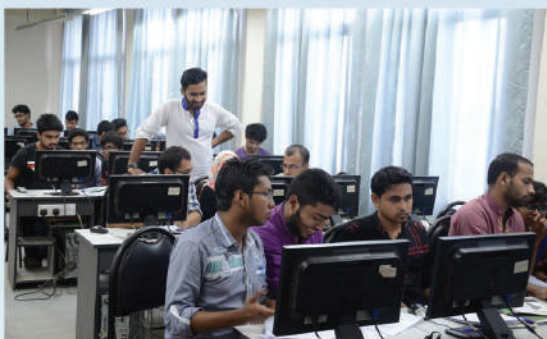
A moment of programming contest (photo caption)