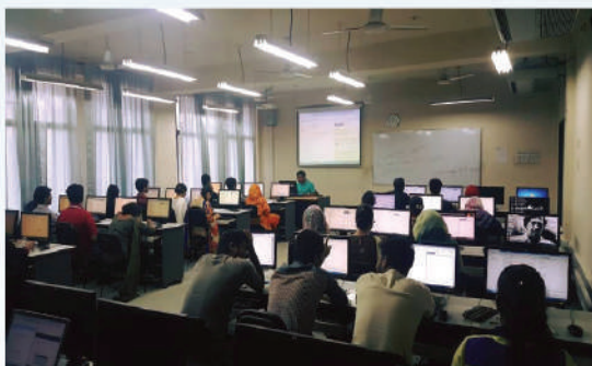
Student learning Latex