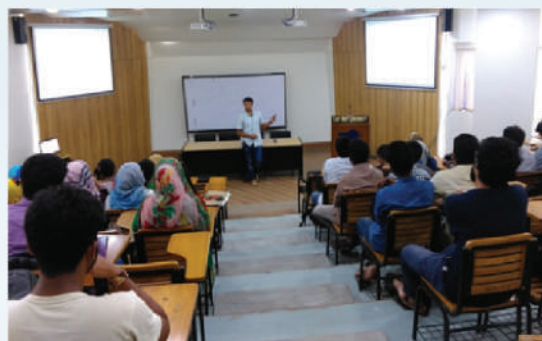
Participants of the workshop with the Resource Persons at the end of the workshop