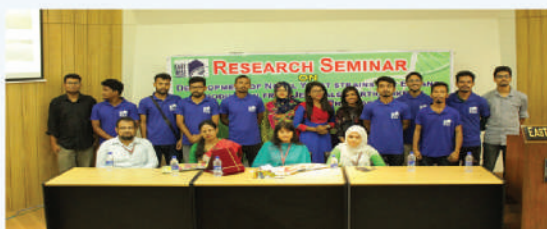
GEB members with the Key note speaker