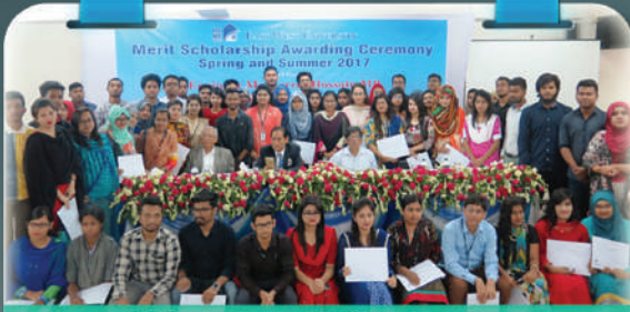
Award Recipients Of Spring Semester